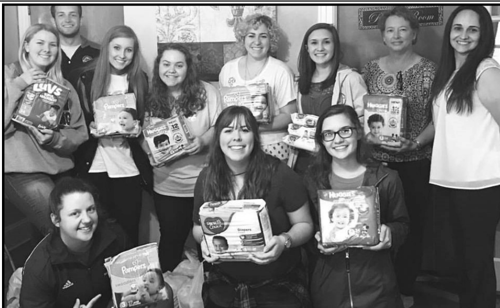
Above: Some of us in my CWOM group helped deliver diapers and wipes to the Natchitoches Women's Shelter as part of our April meeting's Mission Project.