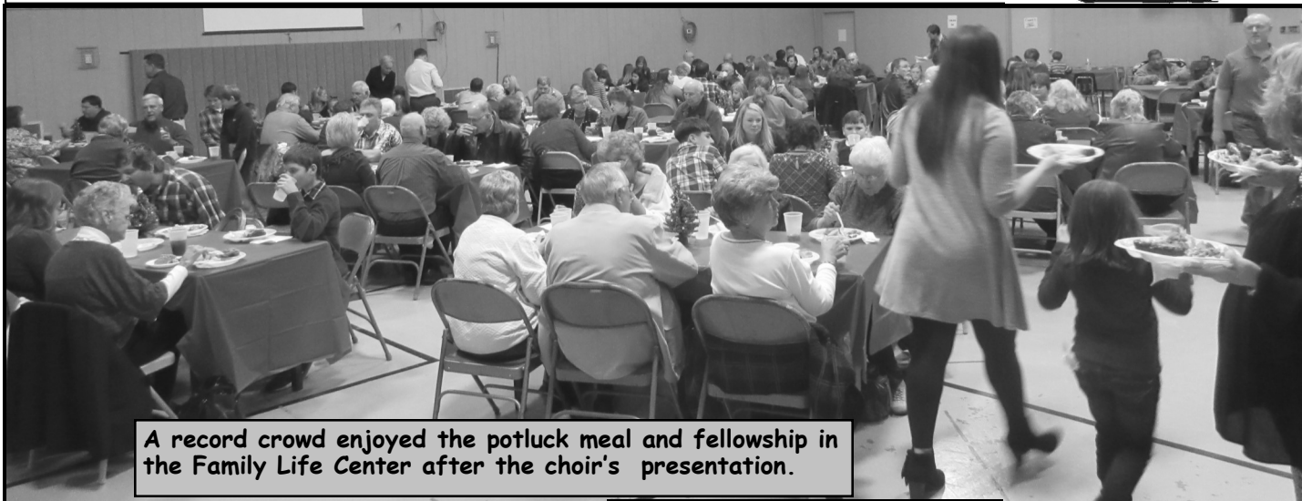
A record crowd enjoyed the potluck meal and fellowship in the Family Life Center after the choir's presentation.